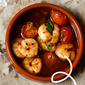
Shrimps in garlic oil