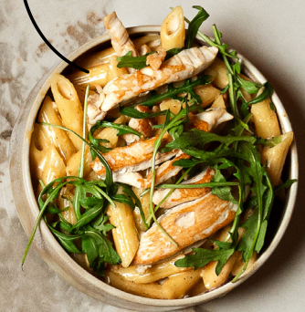
Penne Chicken Alfredo